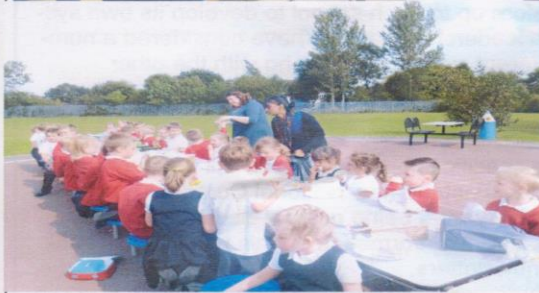
Our wonderful Street Party and Holiday Project Exhibition.